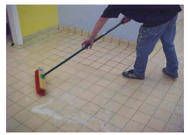
Manual deck scrub